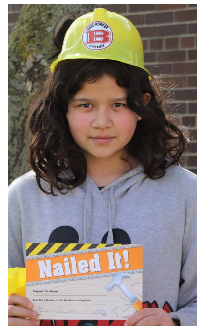
5<sup>th</sup> grade is very excited to announce that